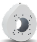
Junction Box (PR-B37JB) is available